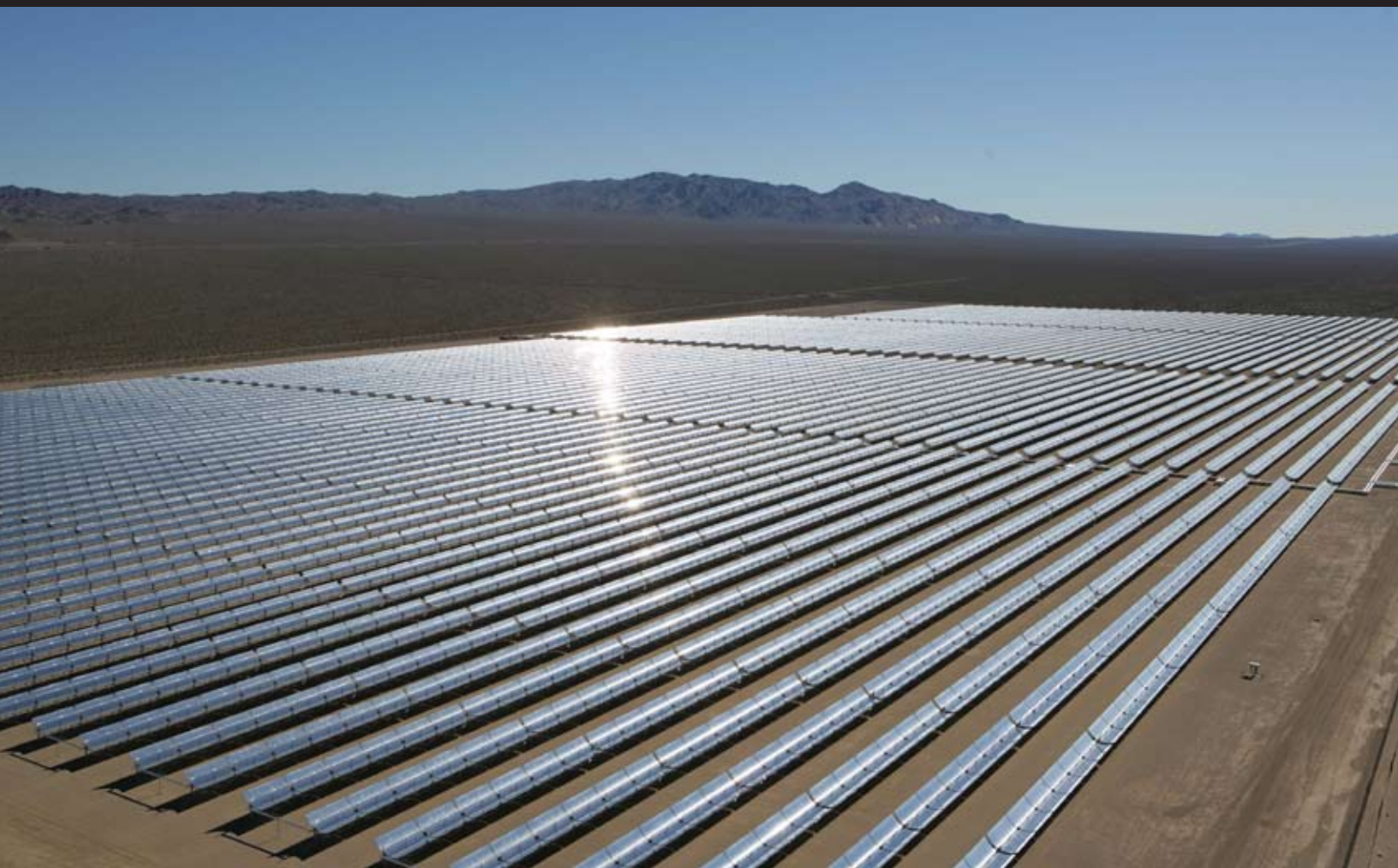
Photograph of Nevada Solar One provided courtesy of Acciona

New Fuel Now is an energy financial destination providing investors with all major oil and gas stocks, coal to liquid stocks, alternative energy, natural gas, solar, hydrogen, coal stocks, potash stocks and many other energy and metals related stocks of the world with their respective data, news, commentary and quotes.